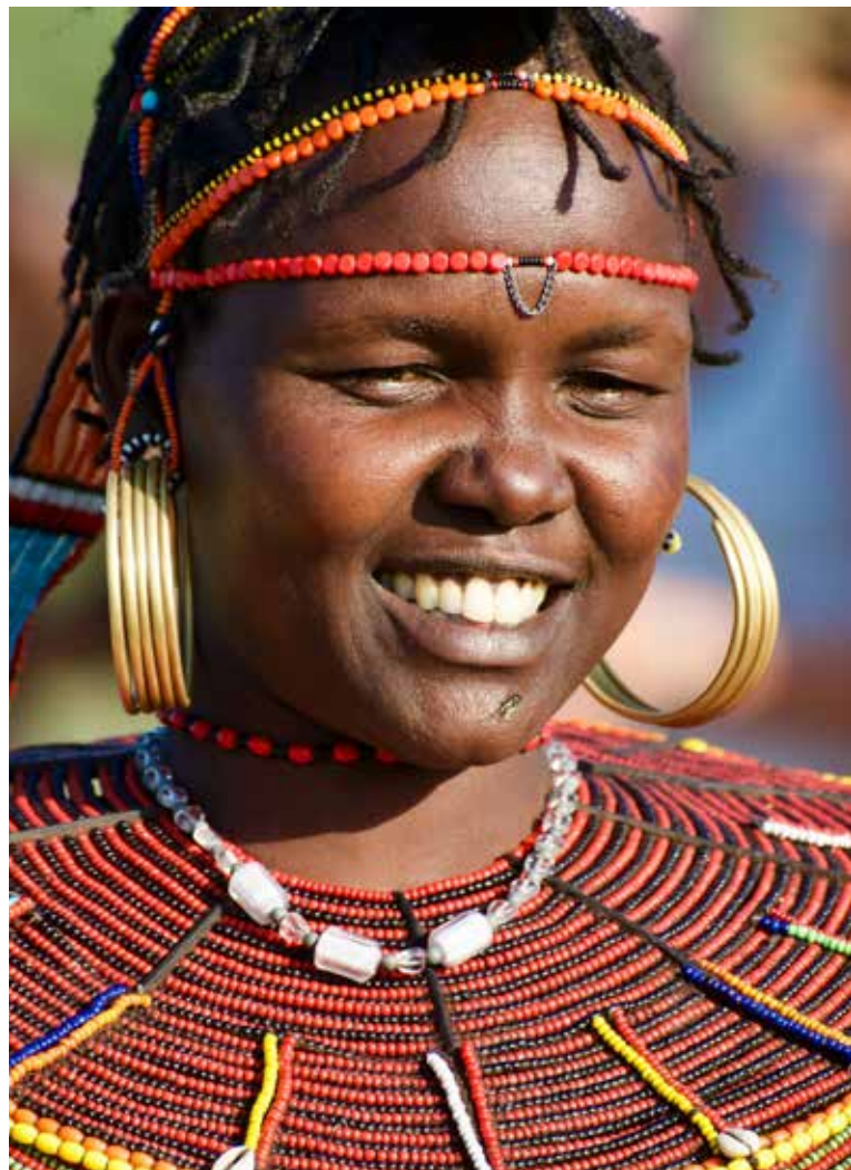
Clockwise from top: Elephant and view of Kilimanjaro; Woman on safari; Amboseli National Park; Maasai woman in Koibatek