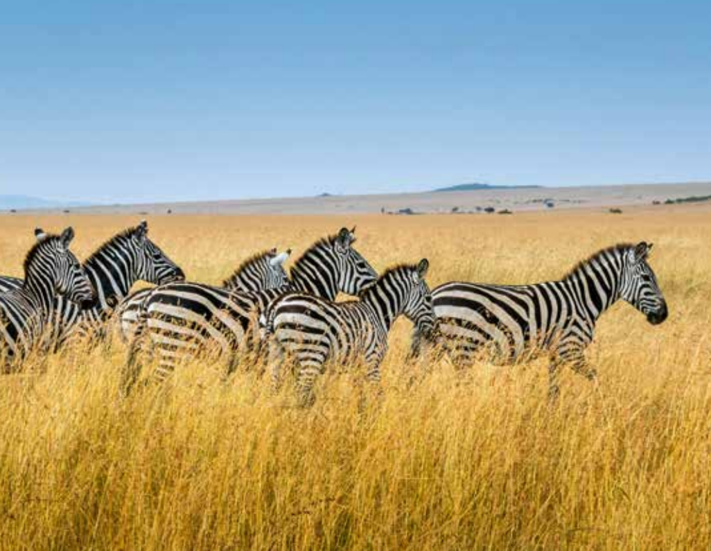
Zebra, Taita Hills