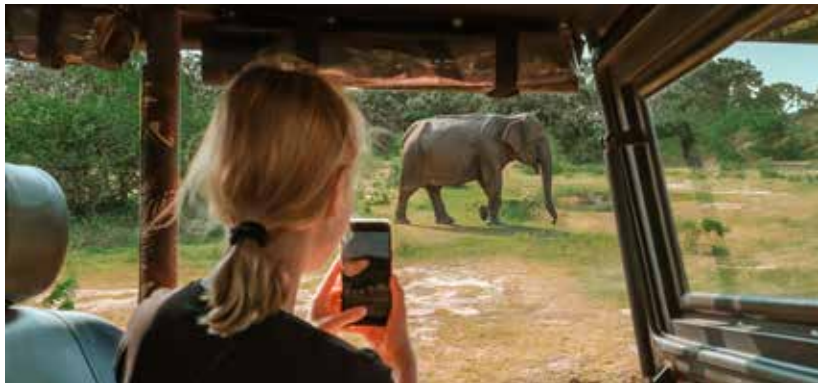
Clockwise from above: Maasai tribe; Lake Naivasha; Wildlife safari