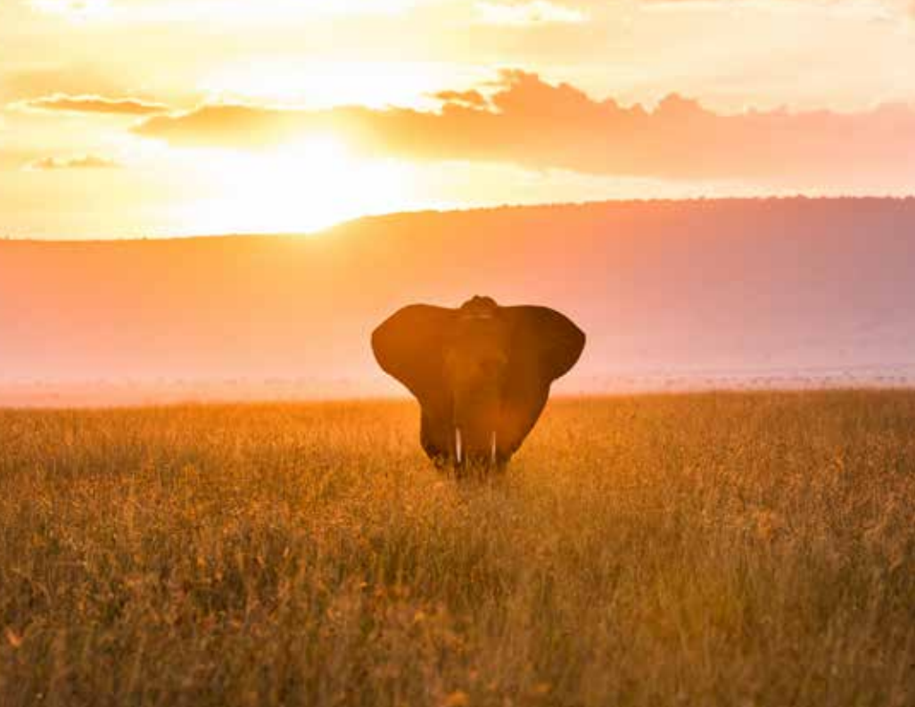
Elephant, Maasai Mara