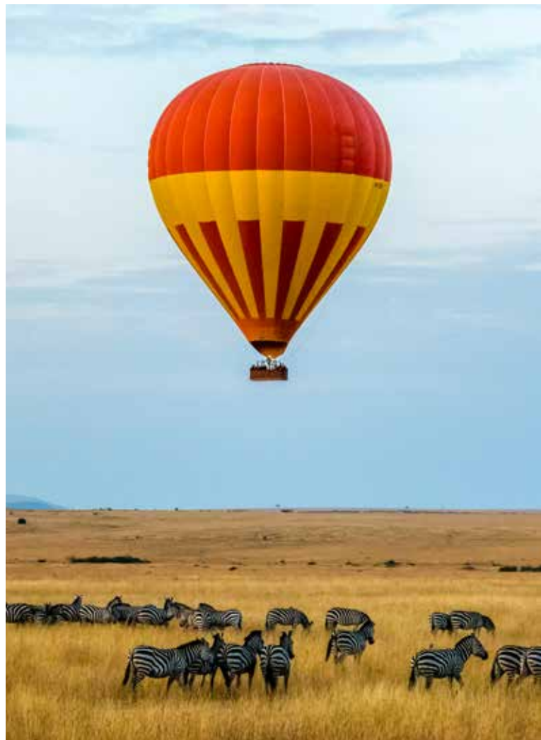
Clockwise from top: Impala, Maasai Mara; Maasai tribesman; Hot air balloon over a herd of zebras, Maasai Mara National Reserve