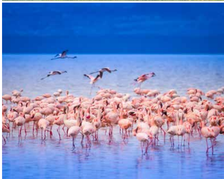
Clockwise from top: Mount Kilimanjaro, Amboseli National Park; Lion, Maasai Mara National Reserve; Maasai Dance; Flamingos, Lake Naivasha