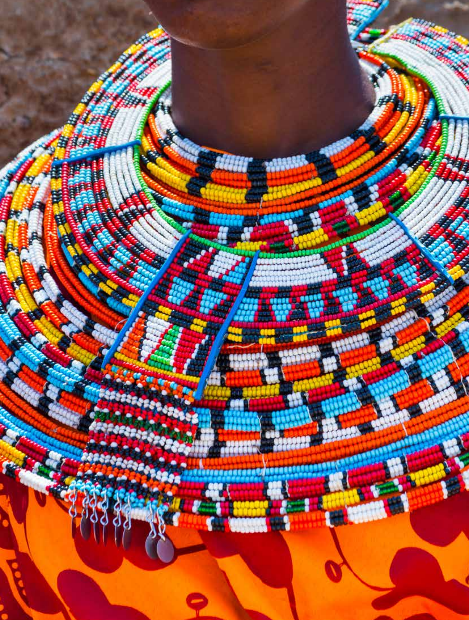
Samburu tribesperson, Samburu National Reserve