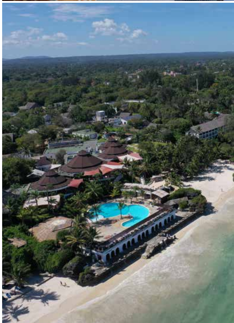
Above: The Ark hotel, Aberdare National Park