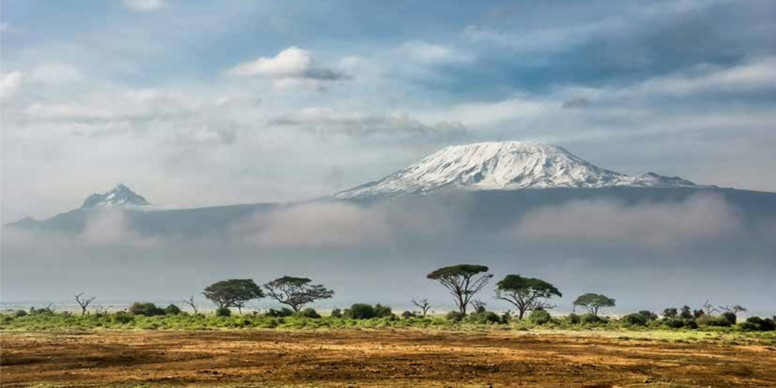
Amboseli National Park