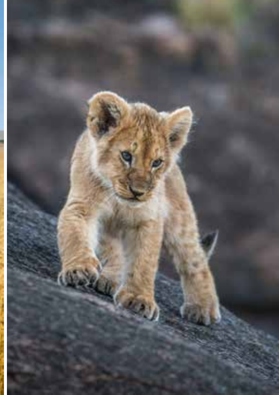
Lion cub, Maasai Mara