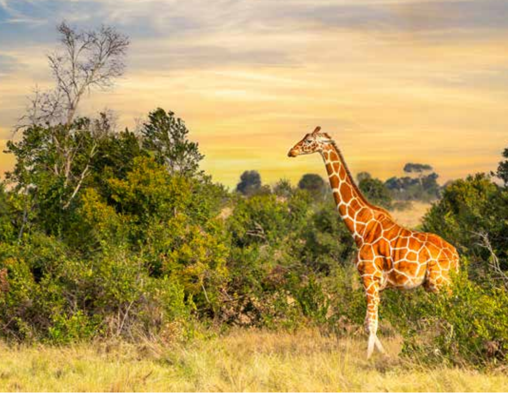
Giraffe, Samburu National Park